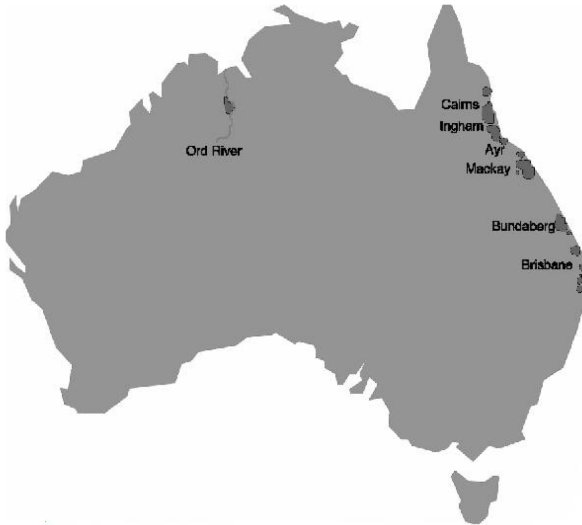
Figure 1. The shaded portions show areas where sugarcane is cultivated in Australia. The breeding stations operated by the BSES are located at Meringa (south of Cairns), Ingham, Ayr, Mackay and Bundaberg.